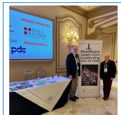
Crans and Strain at FAH