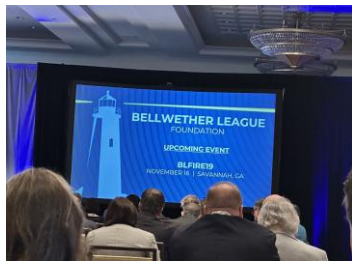
BLFIRE19 promoted at IDN Summit